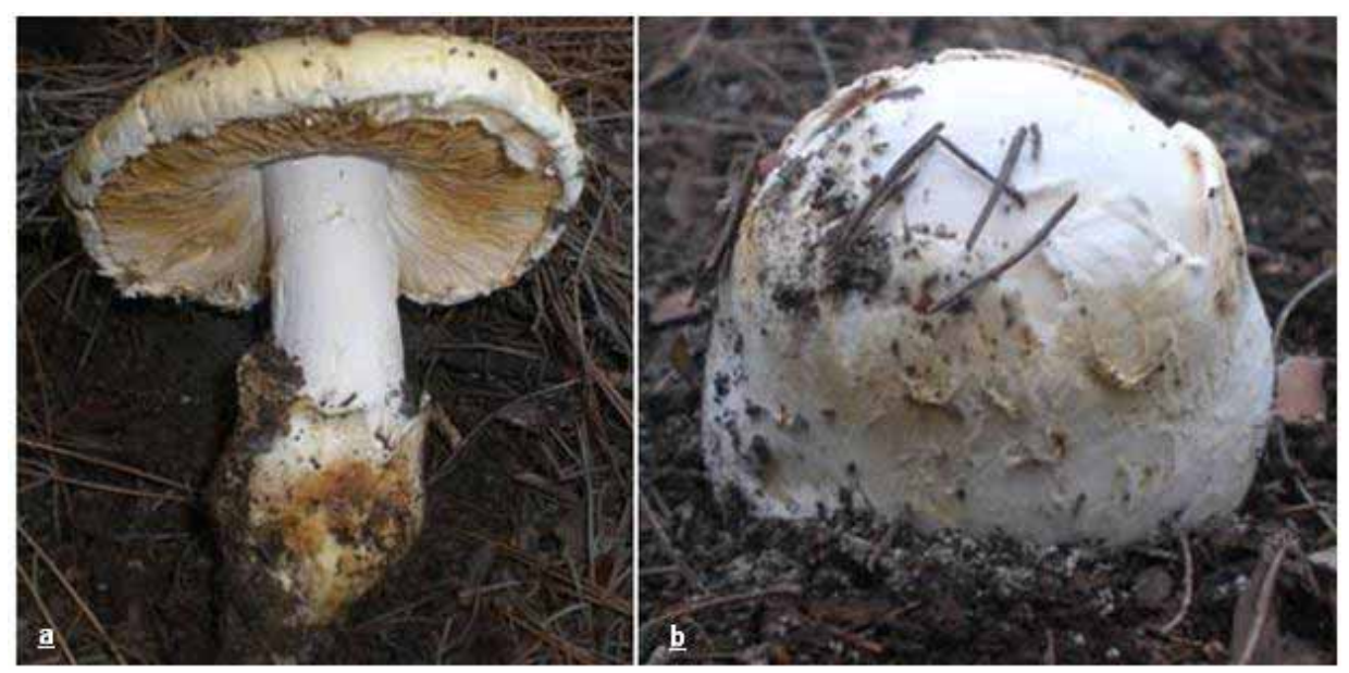
Figure 1. Mature basidiocarp of Amanita phalloides (a) and the egg-like stage of primordial basidiocarp (b) Şekil 1. Amanita phalloides 'in olgun basidiokarpı (a) ve primordiyal basidiokarpın yumurta görünümlü dönemi (b)

Pileus 60-120 mm across, ovoid and completely enclosed in the white universal veil when young, the veil soon breaking and the pileus soon conic-convex to plane, also uplifted in age, surface satiny when dry, somewhat viscid when finely radially fibrillose, color ranging from pale yellow-green to deep olive-green or brown-olive, without or only rarely with white veil remnants, margin smooth, acute (Figure 1). Flesh white, yellowish under the cuticle, thick in the center of the pileus and thin toward the margin, odor sweetish, unpleasant when old, taste mild, nutty. Lamellae are white when young, yellowish in age, broad, free, edge smooth. Stipe is 80-150 x 10-20 mm, cylindrical, base bulbous, solid when young, pithy to hollow when old, elastic, surface with faint to distinct greenish to brownish bands on a whitish background especially toward the base, annulus membranous, whitish, more rarely pale greenish, pendent, upper surface striate, base with a whitish, +/- well defined, membranous-lobed volva (Breitenbach and Kranzlin, 1995).